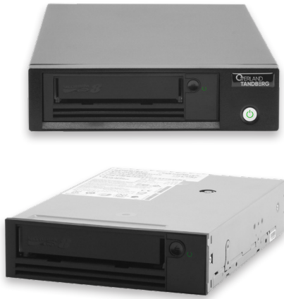
Overland-Tandberg's LTO tape drives are available as internal and external drives

Overland-Tandberg LTO Ultrium tape drives are just one of many products in an entire line of NEO LTO-based storage solutions. Whether you need the simple storage capacity of a single tape drive, or the convenience, reliability, data availability and superior cost of ownership of a NEO Series LTO automated tape library, Overland-Tandberg has the solution that's right for you.