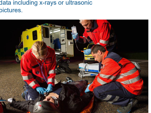
The rugged design makes RDX QuikStor tough enough for daily use in harsh environments and outdoor usage to exchange data between ambulances and hospitals.