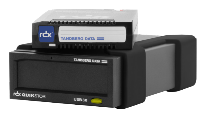
RDX QuikStor is the solution for backup, archiving and data exchange in harsh environments.

The USB port powered RDX QuikStor appliance is a removable disk solution that consists of a QuikStor system and a RDX media. The media is built with a rugged design and requires no special care. It can withstand drops from up to 1 meter on a concrete floor. The cartridge has a sealed interface so dirt and debris can't get inside, and it provides static-proof capabilities. Up to 5000 insertion/removal cycles ensure reliable daily use. An archival lifetime up to 10 years and optional WORM functionalities makes it best for archiving applications. The RDX QuikStor appliance with cartridge capacities from 500GB to 5TB, is an affordable system with a low total cost of ownership.