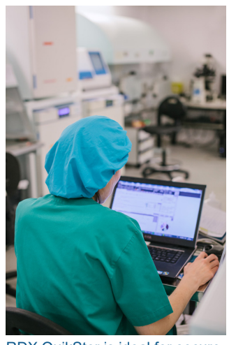
RDX QuikStor is ideal for secure long-term archiving of medical data including x-rays or ultrasonic pictures.