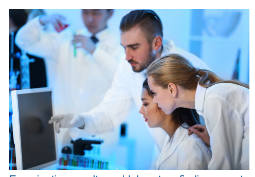
Examination results and laboratory findings must be kept for several years. RDX QuikStor offers an archival life of 10 years with no compatibility issues.