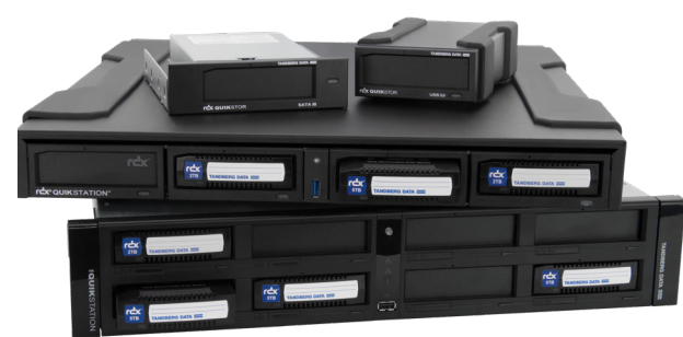
RDX roduct familiy offer ideal solutions for backup, archiving and data exchange for pharmacies and drug stores

* optional features, separate software license required ** available for internal drives with SATA III interface: FIPS 140-2 validation is in progress