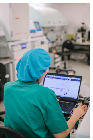
RDX QuikStor is ideal for secure long-term archiving of medical data including x-rays or ultrasonic pictures.