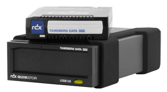
RDX QuikStor is the solution for backup, archiving and data exchange in harsh environments.

The USB port powered RDX QuikStor appliance is a removable disk solution that consists of a QuikStor system and a RDX media. The media is built with a rugged design and requires no special care. It can withstand drops from up to 1 meter on a concrete floor. The cartridge has a sealed interface so dirt and debris can't get inside, and it provides static-proof capabilities. Up to 5000 insertion/removal cycles ensure reliable daily use. An archival lifetime up to 10 years and optional WORM functionalities makes it best for archiving applications. The RDX QuikStor appliance with cartridge capacities from 500GB to 5TB, is an affordable system with a low total cost of ownership.