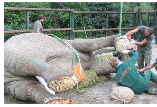
The rugged design makes RDX QuikStor tough enough for daily use in harsh environments and outdoor usage to exchange data between ambulances and hospitals.