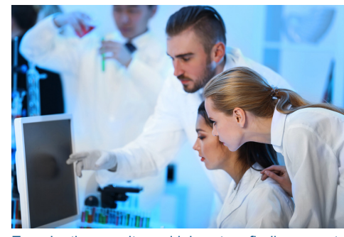
Examination results and laboratory findings must be kept for several years. RDX QuikStor offers an archival life of 10 years with no compatibility issues.