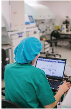
RDX QuikStor is ideal for secure long-term archiving of medical data including x-rays or ultrasonic pictures.

Peace of mind – future proof with unlimited expandability