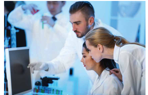
Examination results and laboratory findings must be kept for several years. RDX QuikStor offers an archival life of 10 years with no compatibility issues.