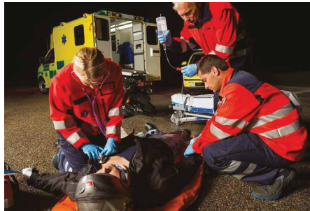
The rugged design makes RDX QuikStor tough enough for daily use in harsh environments and outdoor usage to exchange data between ambulances and hospitals.