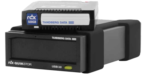
RDX QuikStor is the solution for backup, archiving and data exchange in medical environments

The USB port powered RDX QuikStor appliance is a removable disk solution that consists of a drive and an HDD cartridge. The cartridge is built with a rugged design and requires no special care. It can withstand drops from up to 1 meter on a concrete floor. The cartridge has a sealed interface so dirt and debris can't get inside, and it provides static-proof capabilities. Up to 5000 insertion/removal cycles ensure reliable daily use. An archival lifetime up to 10 years and optional WORM functionalities makes it best for archiving applications. The RDX QuikStor appliance with HDD cartridge capacities from 500GB to 5TB, is an affordable system with a low total cost of ownership.