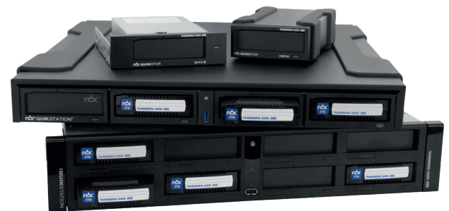
RDX roduct family offer ideal solutions for backup, archiving and data exchange for pharmacies and drug stores

* optional features, separate software license required